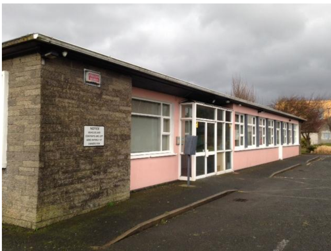
Figure 1: The building used as a temple by the Hindu Cultural Centre of Ireland (HCCI) June 2013-January 2015.

The paucity of public places of worship for Hindus in Ireland has meant that some Hindus have improvised over the years and used existing non-Hindu religious structures as places of worship. One Hindu woman from India who has been living in Ireland for over thirty years told me that up to ten years ago she used to go regularly to the local Catholic church to pray and has also gone on pilgrimage to Knock with her local community group. She explained that for her there is only one god but there are different ways to worship the same god. This attitude towards worshipping the divine in different aspects translates into diversity when it comes to recognising places and objects as religious.